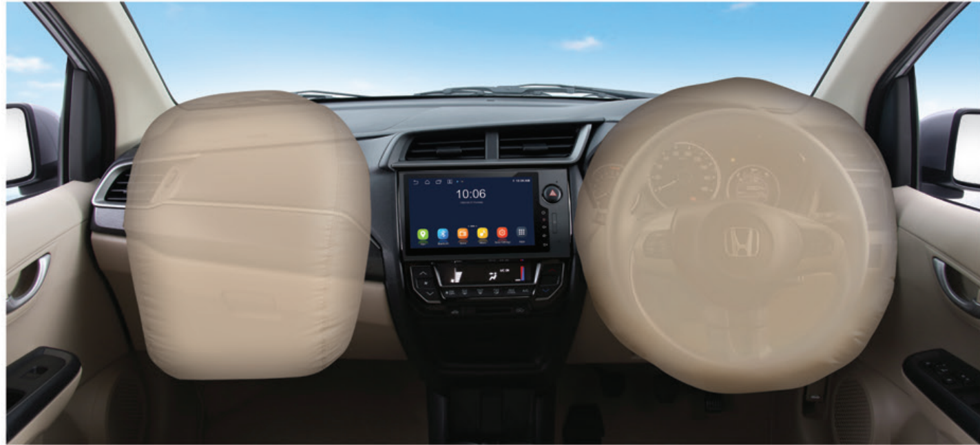
Protects driver and passenger from heavy impacts resulting in head-on collisions.

SAFE & SECURE BR-V comes equipped with safety standards which deliver peace of mind to the passengers.