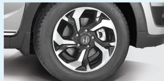
16" DUAL TONE ALLOY WHEELS Dual Tone Alloy Wheels make your ride stylish and eye-catching from the ground up.

STRONG & VALUABLE It never lets you down, from steep slope to uphill, curvy roads to highways, off-roads to main roads. It gives you the presence and features that are both stylish and functional.