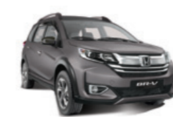
Urban Titanium Metallic