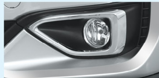
FOG LIGHTS Stay safe in low visibility or low light conditions by switching on the fog lights.