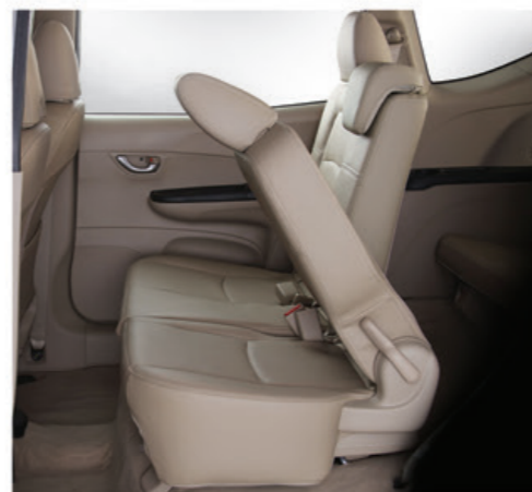
ONE TOUCH TILT 2ND ROW