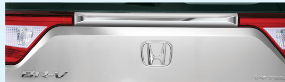
REAR CHROME GARNISH Joined by a reflective bar, it adds more style.