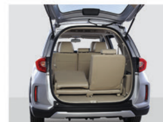
50:50 Folding 3rd Row