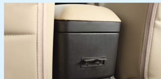
USB CHARGING PORT 4 USB charging ports keeps you connected while you're travelling.