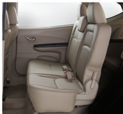
FULLY FOLDABLE 2ND ROW