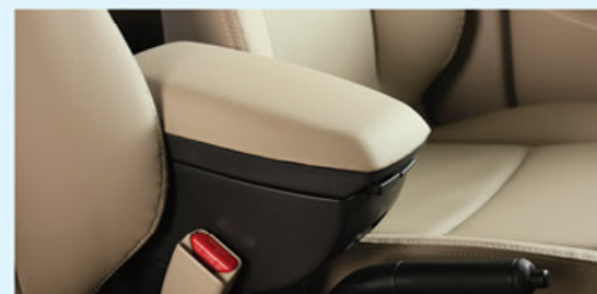
CENTER CONSOLE Interior colored comfortable armrest comes with dual storage compartment.