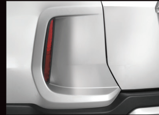
REAR REFLECTOR Eye catching vertical rear reflectors enhances your car's visibility.