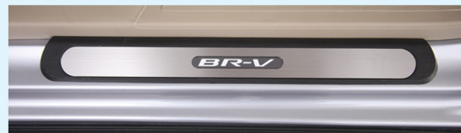
STEP GARNISH Striking illuminated step garnish catches your attention as you open the door.