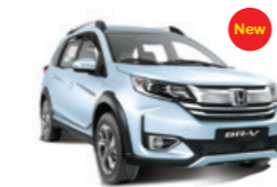
Morning Mist Blue Metallic (OPTIONAL)

Honda Atlas Cars (Pakistan) Limited reserves the right to change or modify equipment or specifications at any time without prior notice. Details, colors, descriptions and illustrations are for information purpose only. Optional features are subject to prices. For further details please check with your nearest Honda dealer or visit www.honda.com.pk