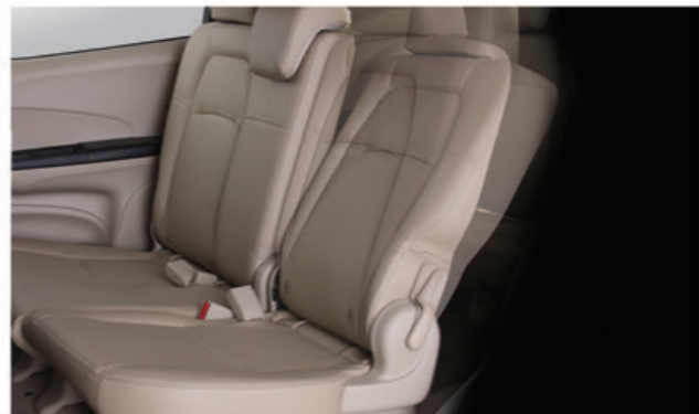
RECLINING 2ND ROW Smoothly slides backwards to adjust the 2nd row passenger's comfort level.