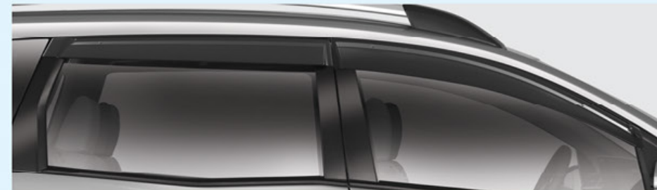
DOOR VISORS These visors are designed to keep the heat out and provide a comfortable ride.