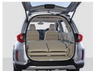
Fully Foldable 2nd Row