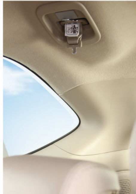
3RD ROW SEAT BELT