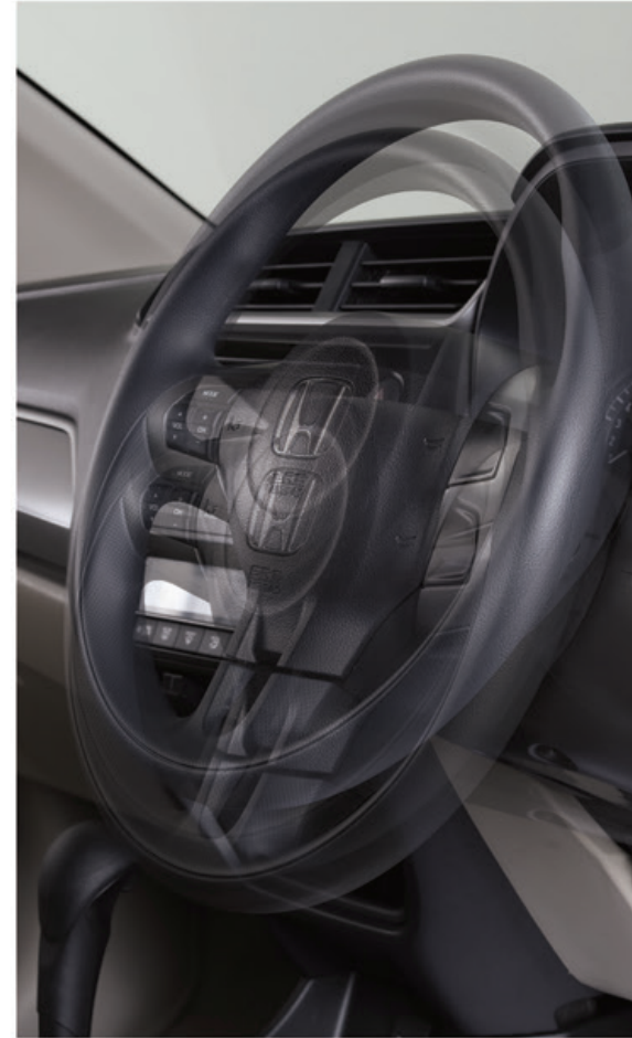
TILT STEERING Helps to adjust the steering wheel by moving the wheel through an arc in an up and down motion.