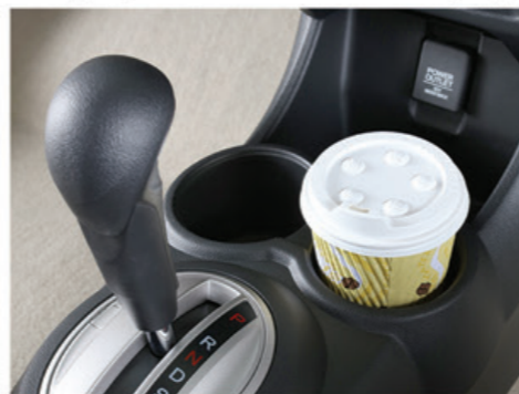
FRONT CUP HOLDER