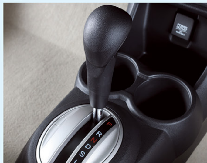
CONTINUOUSLY VARIABLE TRANSMISSION (CVT) WITH ILLUMINATED PATTERN Gives an enjoyable ride and more mileage for less fuel.