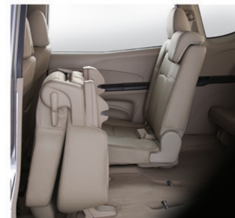
ONE TOUCH TUMBLE 2ND ROW SEAT