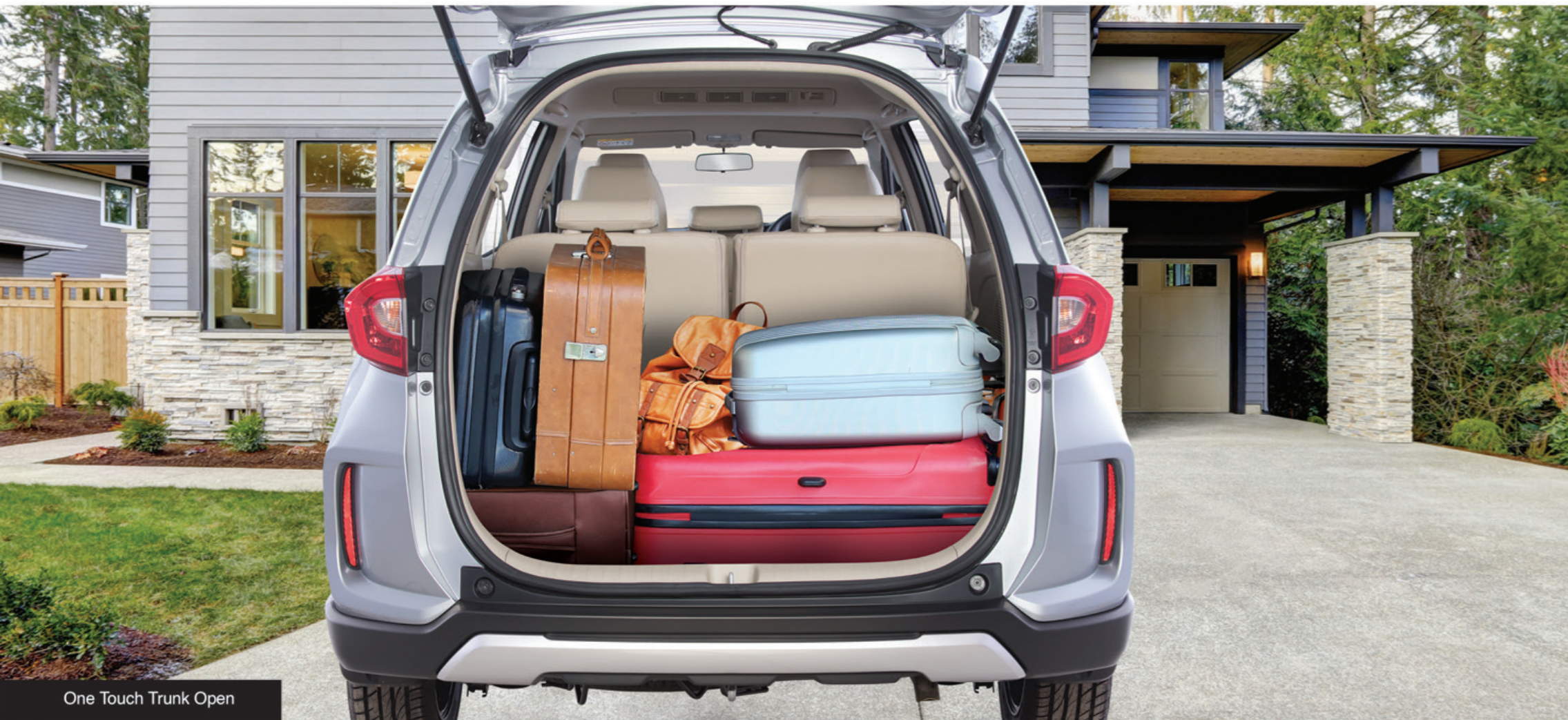
One Touch Trunk Open