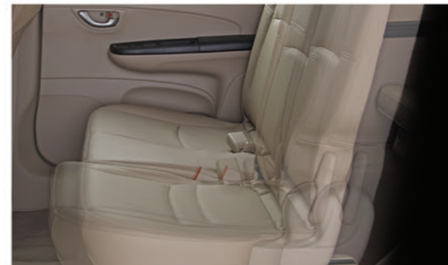
SLIDING SEATS 2ND ROW The 2nd row smoothly slides backwards and forwards to adjust to your passengers comfort level.