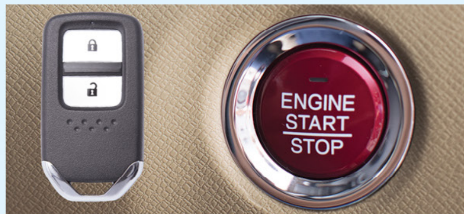
SMART ENTRY WITH PUSH START BUTTON With the key in your pocket, the doors will unlock as you approach and the engine starts with the push of a button.

EVERY FEATURE OFFERS A LUXURIOUS EXPERIENCE Engineered to give best performance on any track, the BR-V is energy efficient yet responsively powerful and fun to drive.