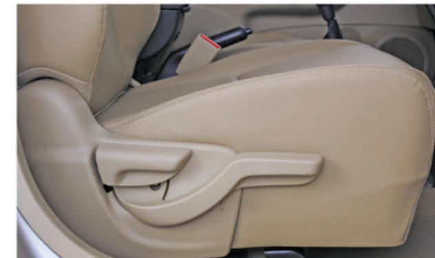
DRIVER SEAT HEIGHT ADJUSTER Feel at home on every journey by adjusting your seat the way you like.