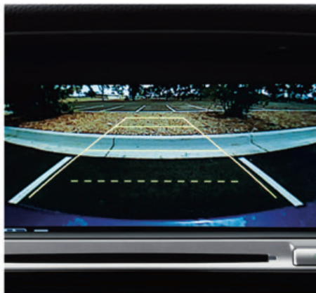
Parking ease and convenience with better rear vision.