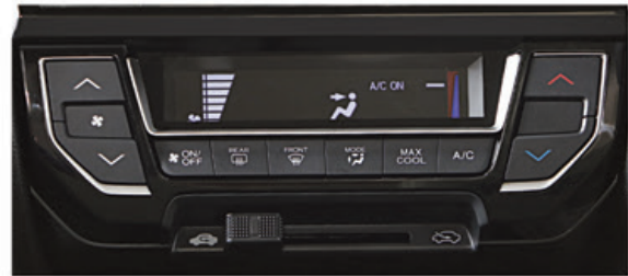
DIGITAL AIR-CONDITIONER Digital controls of the Air-Conditioner give great cooling instantly.