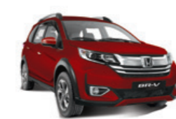
Carnelian Red Pearl