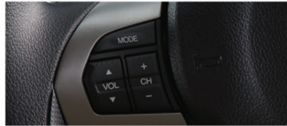
AUDIO STEERING SWITCH Control your audio system without taking your hands off the steering wheel.