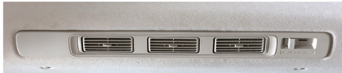
REAR AIR-CONDITIONING Keeps all passengers cool and comfortable with a dedicated vent for cooling the rear seats.