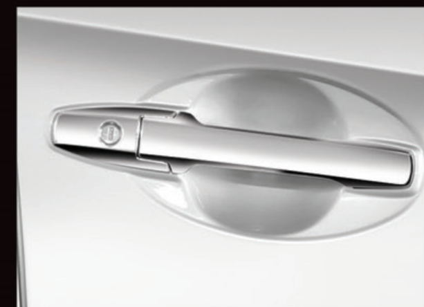
CHROME DOOR HANDLES The high gloss shiny chrome finished handles adding stance to the exterior.