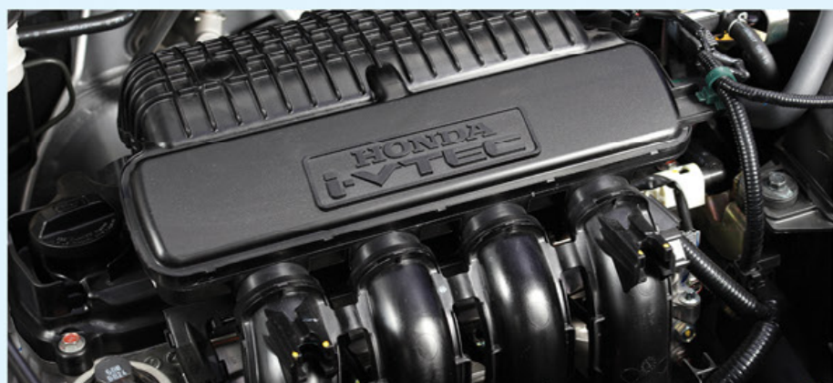
1.5L i-VTEC ENGINE Honda's legendary 1.5L i-VTEC Petrol engine gives you a fierce combination of high power output and class leading fuel efficiency.