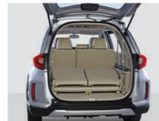
Fully Foldable 3rd Row