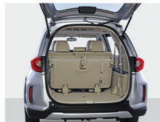
One Touch Tumble 3rd Row Seat