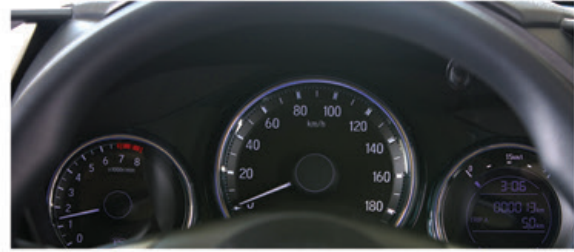
METER CLUSTER WITH MULTI INFORMATION LCD DISPLAY Display screen shows driver information.

The luxuriously designed cabin that makes you drive the car everyday, from hands on features to flawless functionality.