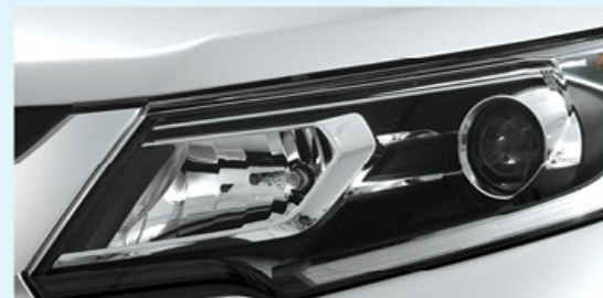
PROJECTOR HEADLAMPS WITH LED POSITION LIGHTS Designed to give superior illumination at night while improving your visibility.