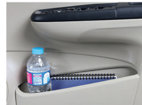
FRONT DOOR POCKET