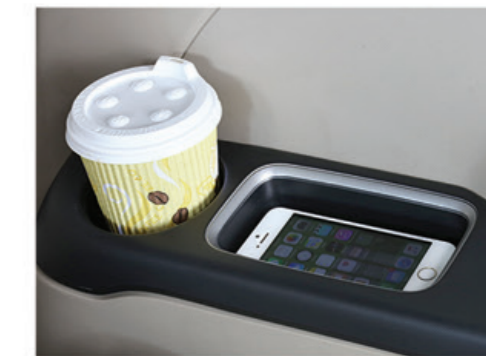
3rd ROW MOBILE AND GLASS HOLDER