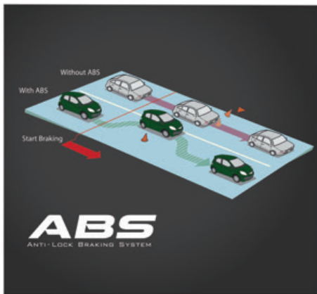
ABS improves vehicle control by preventing wheels from locking in case of sudden braking.