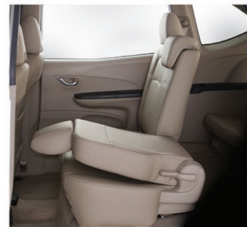
50:50 FOLDING 2ND ROW