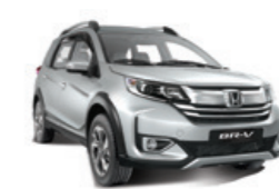
Lunar Silver Metallic