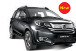
Meteoroid Gray Metallic (OPTIONAL)