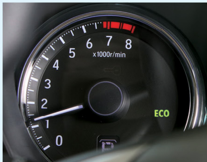
ECO INDICATOR The indicator lights up when your driving style is fuel efficient.

STRONG & VALUABLE It never lets you down, from steep slope to uphill, curvy roads to highways, off-roads to main roads. It gives you the presence and features that are both stylish and functional.