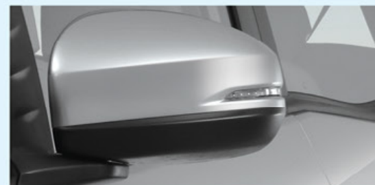
POWER RETRACTABLE SIDE MIRRORS Power Retractable & fully adjustable side mirrors with integrated turn signals indicators make driving safe & easy.