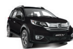
Crystal Black Pearl