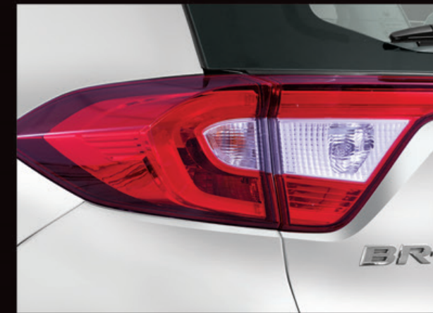
LED TAIL LIGHTS The stylized LED tail lights.

BR-V driving experience becomes more confident with the modern design, because of its refined and stylish exterior appearance.