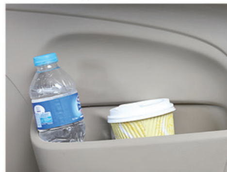
REAR DOOR POCKET